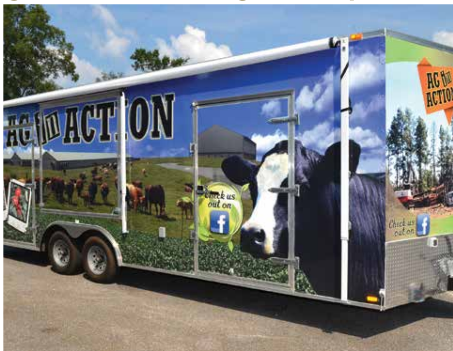
School children experience farming activities through the Ag in Action trailer.

Students have the opportunity to become a farmer and harvest virtual row crops through the magic of audio visuals in the cab. The simulator provides students the experience of riding in the combine cab, wrangling cattle, harvesting timber and working in a poultry house.