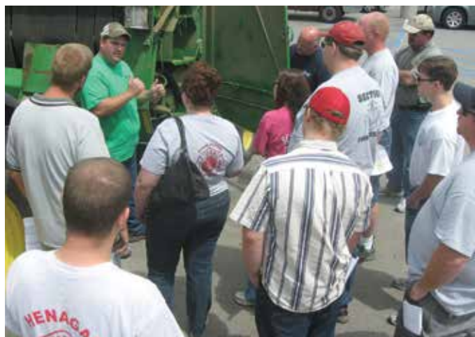
The DeKalb County Young Farmers Committee and nearby counties sponsored a farm equipment safety day at Northeast Alabama Community College. Through the school's continuing education program, area volunteer firefighters and first-response personnel received training credit for attending. Participants received hands-on training for combines, hay balers and poultry house control panels. The training illustrates the importance of being familiar with farm equipment. The Young Farmers continued the program for fifth- and sixth-grade students at Farm Day at Sylvania School.