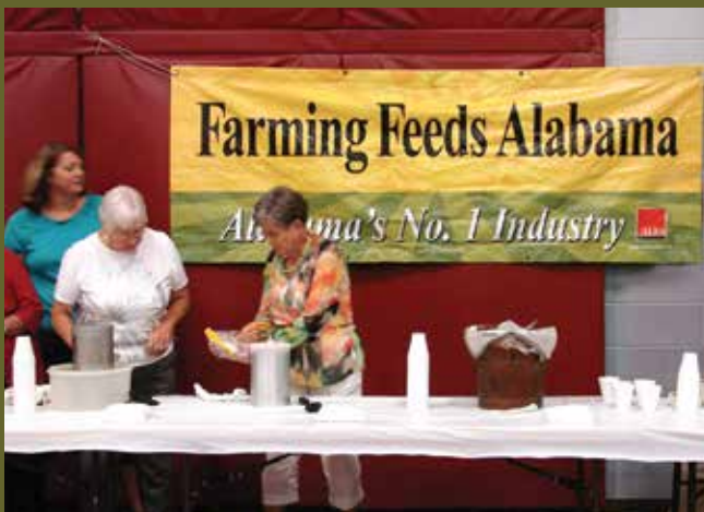
Members of the Morgan County Women's Leadership Committee serve ice cream to attendees at the annual meeting.