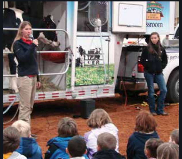
Third-grade students from every Morgan County school attend Farm Day at the Morgan County Celebration Arena. Students learn the importance of agriculture and how farmers impact their lives every day. Members of the Morgan County Farmers Federation are among volunteers for the annual event. Farm Day attractions include the Mobile Dairy Classroom, which shows students how cows are milked.