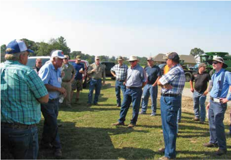
The Blount County Farmers Federation regularly hosts row crop tours at local farms. The 2014 tour focused on farms in the Snead area. Farmers were invited to tour cotton, peanut, corn, soybean and hay fields. Extension agents, representatives from ag companies and ag lenders were present to speak with attendees.