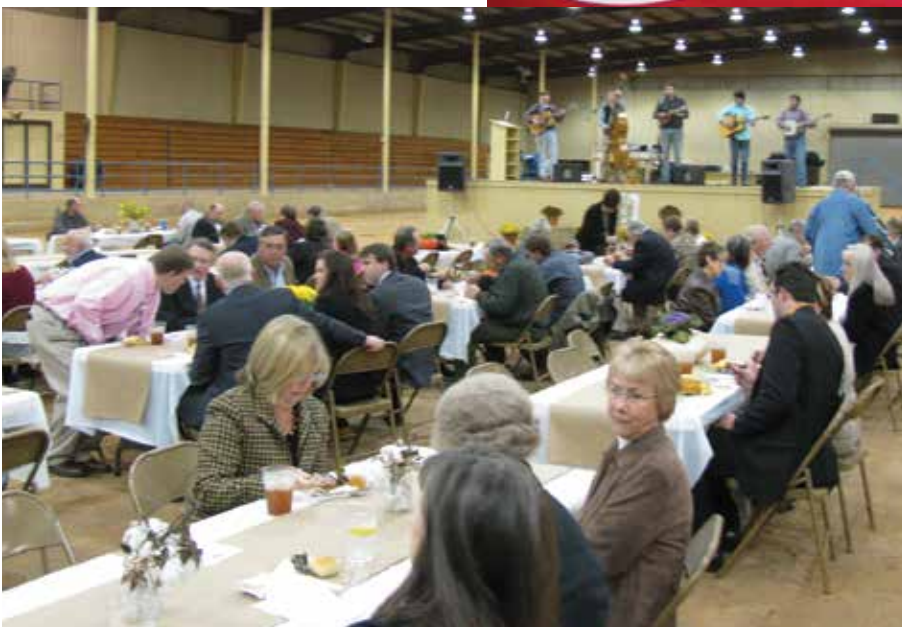
Farm-City Week is celebrated the week leading up to Thanksgiving. The Blount County Farm-City Committee uses PSAs, letters to the editor, and the Blount County Farm-City Facebook page to explain the importance of city workers and farmers working together to get food and fiber into our homes. The Farm-City Banquet is held the Thursday before Thanksgiving. In recent years, local businesses sponsored tables and were invited to attend, along with community and school leaders, lawmakers and farmers. The event included a meal, speakers and entertainment, and ag book donations to local school libraries. Food and supplies were donated to Filling Station 56, a soup kitchen in Blountsville. Each fall, Poster, Essay and Multimedia contests are held for K-12 students. Winners were recognized at the banquet and will compete in the state contest.