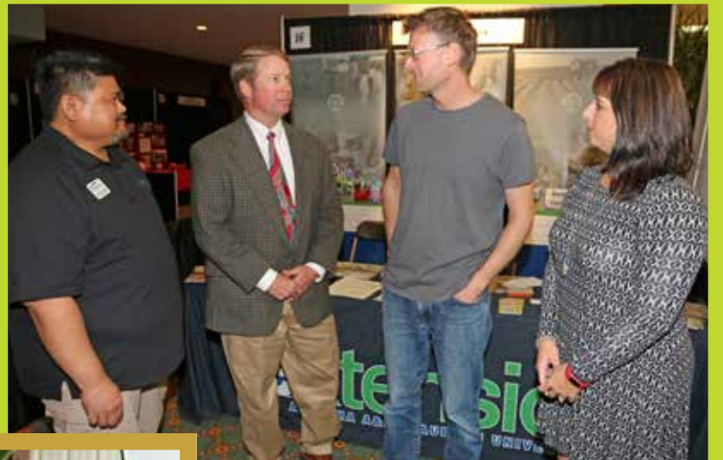
Alabama Wheat & Feed Grain Producers provided funding for new Farming Feeds Alabama commercials that will be aired in 2017 on stations across the state. As part of the commercial package, a short video about wheat and feed grain farming in the state was produced. See links to the commercials at AlfaFarmers.org or GrainsOfTruth.net .