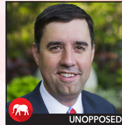
UNOPPOSED FOR ASSOCIATE JUSTICE OF THE SUPREME COURT, PLACE NO. 4 ● JAY MITCHELL