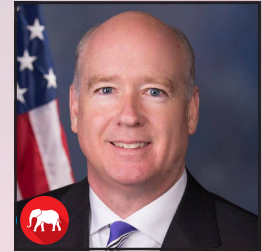
FOR UNITED STATES REPRESENTATIVE 4TH CONGRESSIONAL DISTRICT ● ROBERT B. ADERHOLT