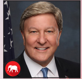
FOR UNITED STATES REPRESENTATIVE 3RD CONGRESSIONAL DISTRICT ● MIKE ROGERS