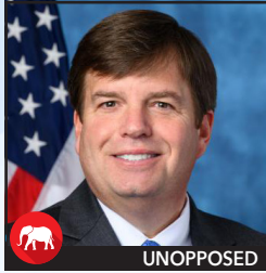
UNOPPOSED FOR UNITED STATES REPRESENTATIVE 5TH CONGRESSIONAL DISTRICT ● DALE STRONG