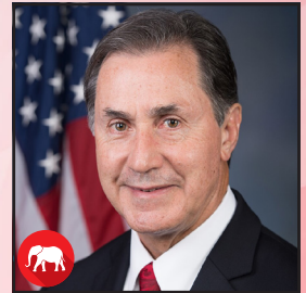
FOR UNITED STATES REPRESENTATIVE 6TH CONGRESSIONAL DISTRICT ● GARY PALMER