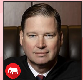
FOR COURT OF CIVIL APPEALS JUDGE, PLACE NO. 2 ● CHAD HANSON