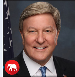
FOR UNITED STATES REPRESENTATIVE 3RD CONGRESSIONAL DISTRICT ● MIKE ROGERS