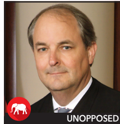
UNOPPOSED FOR ASSOCIATE JUSTICE OF THE SUPREME COURT, PLACE NO. 3 ● WILL SELLERS