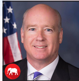
FOR UNITED STATES REPRESENTATIVE 4TH CONGRESSIONAL DISTRICT ● ROBERT B. ADERHOLT