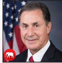
FOR UNITED STATES REPRESENTATIVE 6TH CONGRESSIONAL DISTRICT ● GARY PALMER