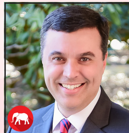
FOR COURT OF CRIMINAL APPEALS JUDGE, PLACE NO. 2 ● THOMAS GOVAN